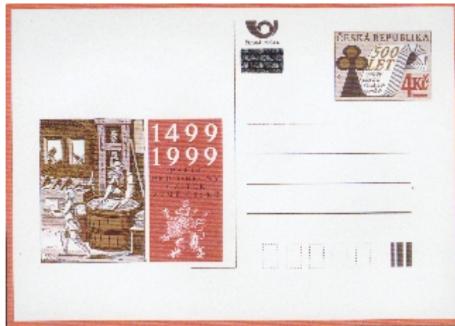
Figure 2. Commemorative postal card issued by Czech Republic to commemorate 500 years of the production of paper in Czech lands.

On May 12, 1999, the Czech Republic issued a commemorative postal card with imprinted 4 Kc stamp to commemorate 500 years of the production of paper in Czech lands (van Zanten, 1999). The card is shown in Figure 2 .