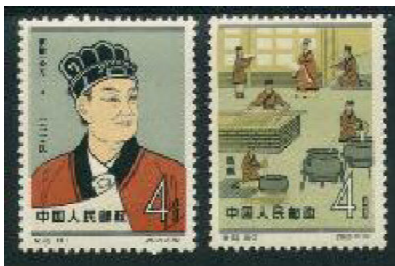
Figure 1. The inventor of paper making, Ts'ai Lun, at left, and a depiction of his process, right, on two 1962 stamps issued by People's Republic of China.

The Chinese, as early as the second century B.C. used paper. Paper is considered to have been invented in China in 105 A. D. by Ts'ai Lun (sometimes referred to as Cai Lun), who served in the court of Emperor He Di in Hunan. Ts'ai Lun and the paper-production process he invented were featured on two 1962 stamps from People's Republic of China, as shown in Figure 1 .